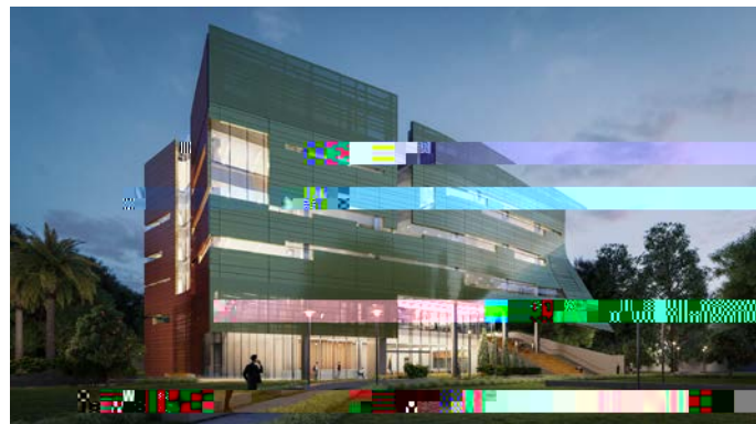
Genshaft Honors College proposed structure

that will be named the Judy Genshaft Honors College.